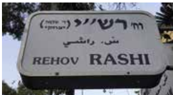
Road Sign, Tel Aviv

Via the staircase you now reach the basement, along various objects.