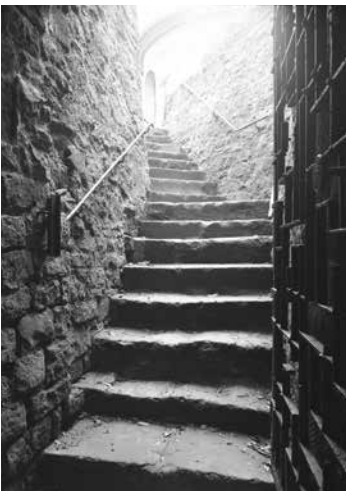
Mikveh Worms

ShUM on the Rhine ... every Jewish community needs water for ritual purification. What is a mikveh? When do women or men use the ritual bath? When were the monumental mikva'ot in ShUM built? Immerse yourself and get to know this cleansing process – also through a film that lets you descend into the breathtaking medieval mikveh in Speyer.