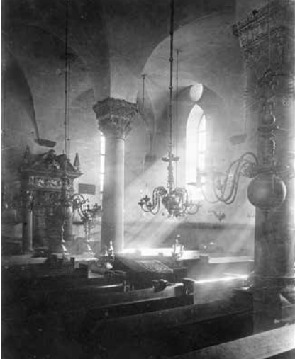
Synagogue, Interior Worms, 1920s