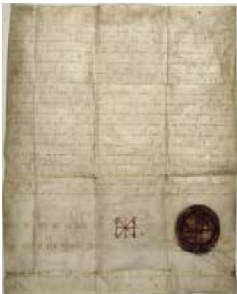
Privilege 1074. The original is stored in the City Archive in the Rashi-House.

Imperial cathedrals and Jewish quarters are in close vicinity in the ShUM cities. When did Jews come to the three cities on the Rhine? Legends and unique documents tell you about this.