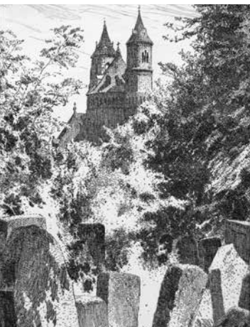
Heiliger Sand. View of the cathedral, drawing, 1920s

Chevra Kadisha from the early 17th century – one of the oldest Judaica in Germany.